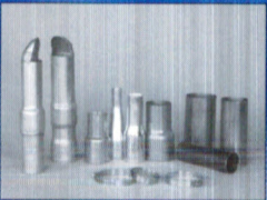
Wall & Hose accessories