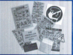
Instruction, Warning labels